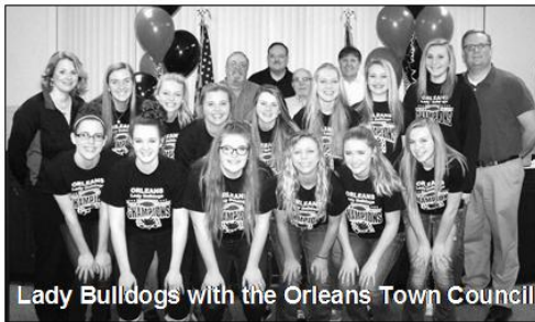
Lady Bulldogs with the Orleans Town Council